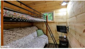
the bunkie is soo cute