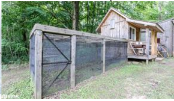
Garden/coop beside bunkie