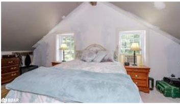
Upstairs primary bedroom