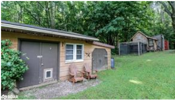
approx 40 x 15 shop/garage