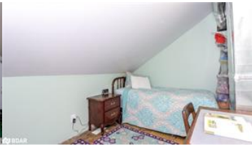
2nd bedroom upstairs